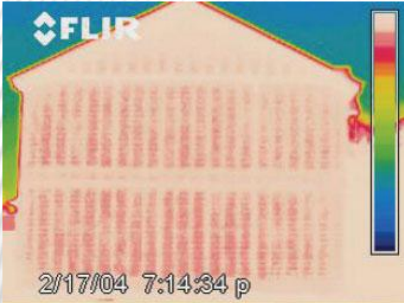
Infrared Stick Built Image